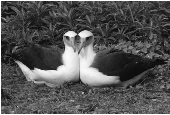
Figure 1. A female-female Laysan albatross pair at Kaena Point.

incubation duties. All females in these pairs were unrelated ( p > 0.05 for all pairwise comparisons). Female-female pairs were also present in Laysan albatross on Kauai ( N = 18 ).